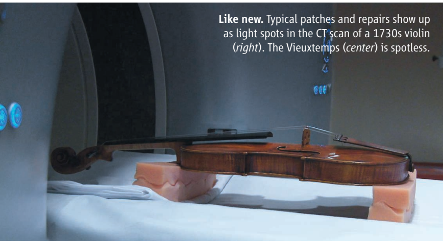
Like new. Typical patches and repairs show up as light spots in the CT scan of a 1730s violin (right). The Vieuxtemps (center) is spotless.